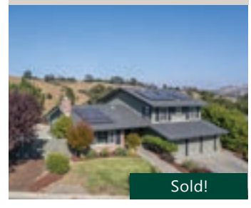
92 Warfield Drive Classic two story 5 bd/ 3 ba home sits on a private .39 acre parcel w/ 2527 sq.ft of a fully functional floor plan!