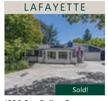
1336 San Reliez Court Rare opportunity on .75 acre lot w/ 5 bd/ 3.5 ba 4098 sq.ft. in the heart of Springhill!