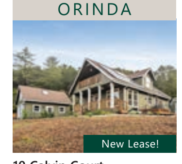
10 Calvin Court A Little Southern Charm in Orinda! 3 bd/ 2.5 ba home on a private .53 acre in the Glorietta neighborhood!