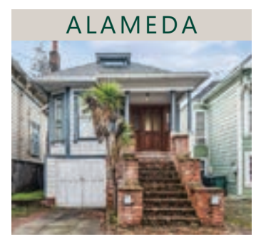
2114 Buena Vista Permitted duplex on 4,500 sq. ft. lot in Central Alameda! Unit A - 2bd/ 1 ba, w/ formal dining room. Unit B - 1 bd/ 1 ba, w/ lg living space!