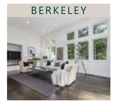
7164 Buckingham Blvd Sophisticated contemporary 3 bd/ 3 ba set in the Claremont Hills featuring lovely canyon views!