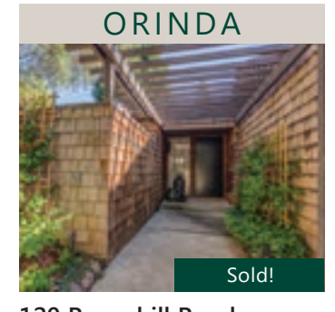
120 Ravenhill Road Completely renovated 3 bd/ 3 ba Orindawoods home offers an ideal setting w/ natural light, privacy & views!