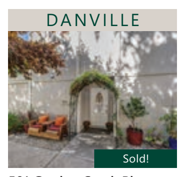
501 Garden Creek Place Updated 3 bd/ 2.5 ba end-unit townhome less than .5 miles from top-rated schools, downtown & more!